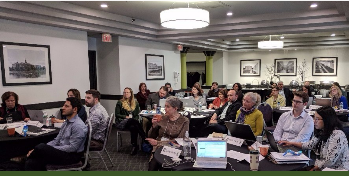
Pictured above: 2017 CEDARTREE-NIDUS Boot Camp participants

*Due to limited availability, late applications will not be considered*